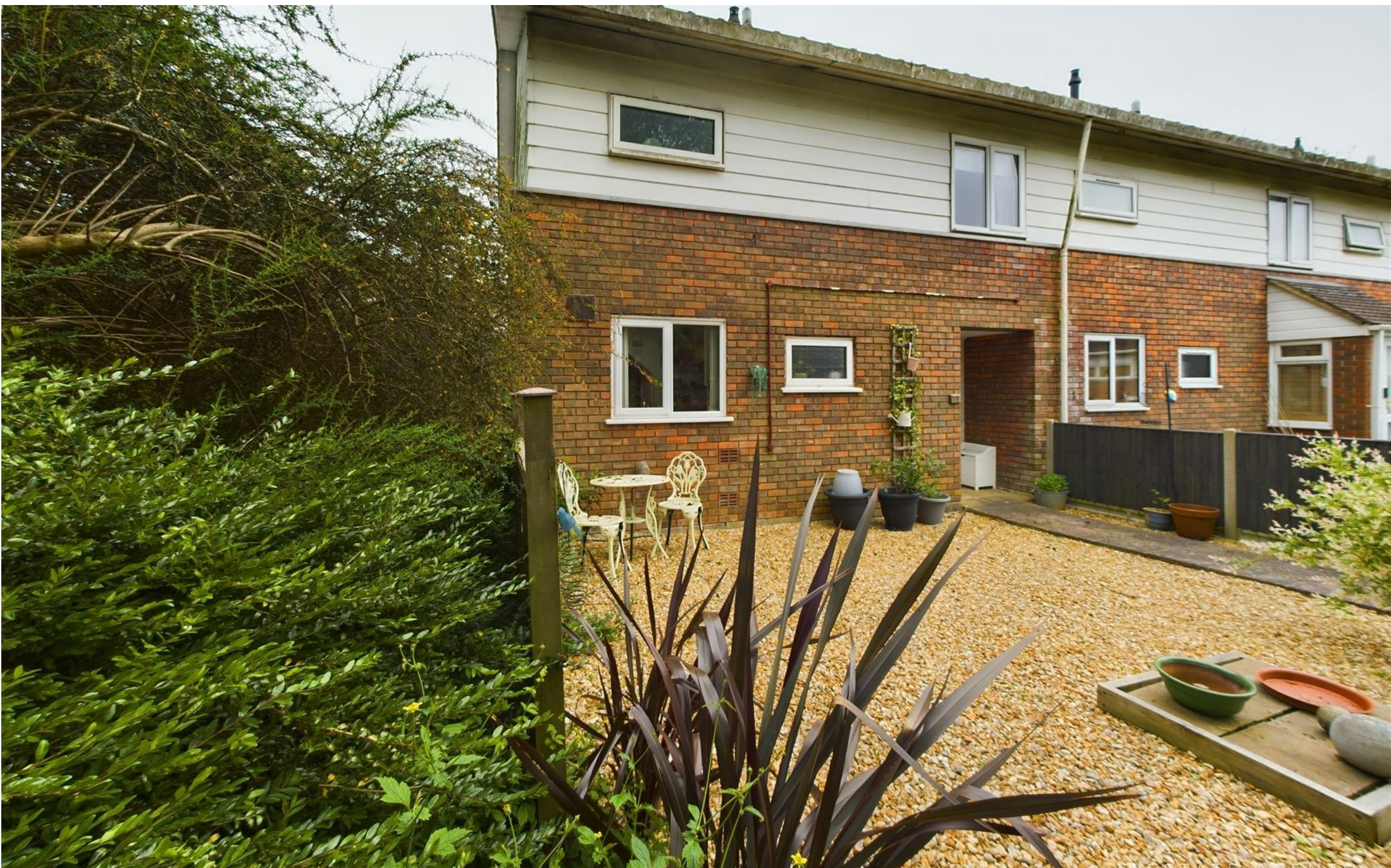
Bach Close, Brighton Hill, Basingstoke, RG22 4JZ